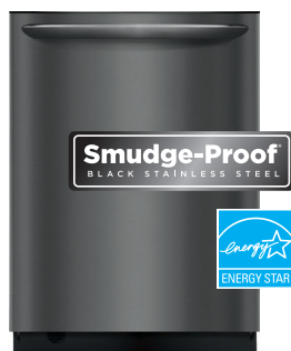
24" Built-In Tall Tub Top Control Dishwasher with 3rd Rack FGID2479SD