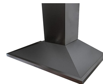
30" Chimney Mount Hood ZANE30CBS