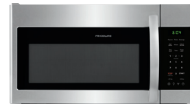
1.8 Cu. Ft Over-The-Range Microwave FFMV1846VS