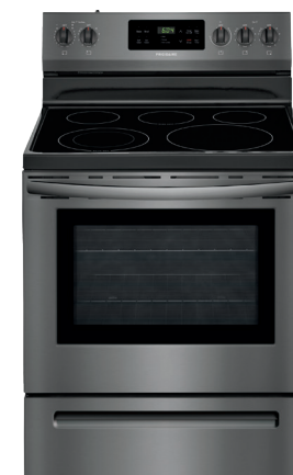
30" Electric Self-Cleaning Freestanding Range FFEF3054TD