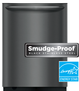
24" Dishwasher FGID2468UD / GDPH4515AD