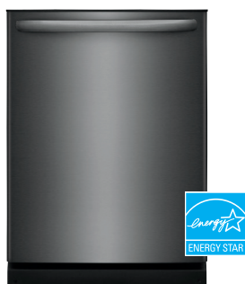
24" Dishwasher FFID2426TD