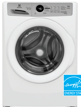
4.4 Cu. Ft. Front Load Washer ELFW7337AW