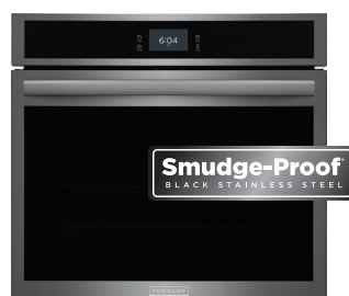
30" Single Electric Wall Oven with Total Convection GCWS3067AD