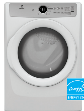
8.0 Front Load Dryer ELFE7337AW (Electric) ELFG7337AW (Gas)