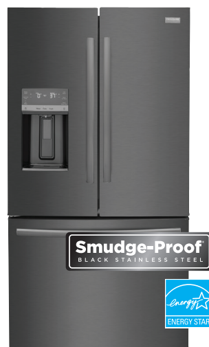
22.6 Cu. Ft. Counter-Depth French Door Refrigerator GRFC2353AD