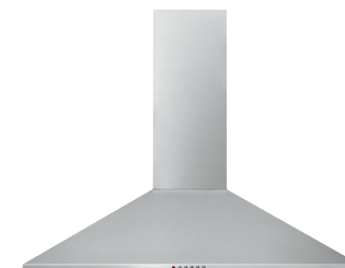
Chimney Wall- Mount Hood FHWC3055LS