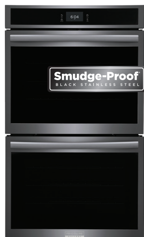
30" Double Electric Wall Oven with Total Convection GCWD3067AD