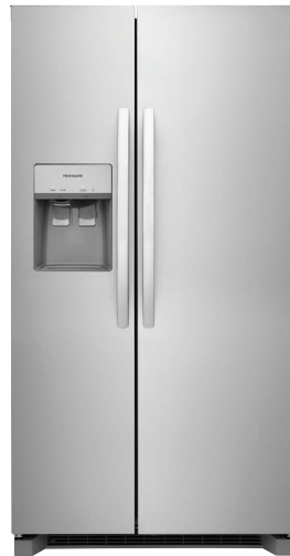
22.3 Cu. Ft 36" Counter Depth Side by Side Refrigerator FRSC2333AS