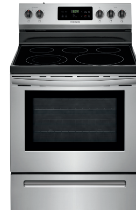
30" Electric Self-Cleaning Freestanding Range FFEF3054TS