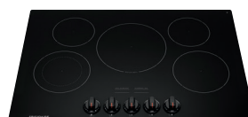
30" Electric Built-In Cooktop FGEC3068UB