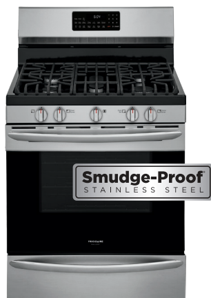
30" Gas Freestanding Range with Air Fry GCRG3060AF