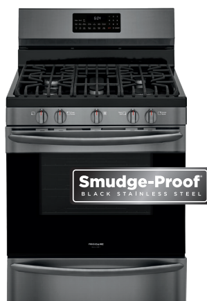
30" Gas Freestanding Range with Air Fry GCRG3060AD