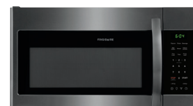
1.8 Cu. Ft. Over-The-Range Microwave FFMV1846VD