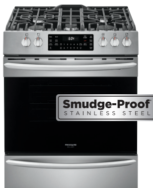
30" Gas Self-Cleaning Freestanding Range featuring Air Fry FGGH3047VF