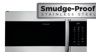
1.7 Cu. Ft. 30" Over-The-Range Microwave FGMV17WNVF