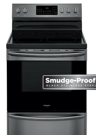
30" Electric Freestanding Range with Air Fry GCRE3060AD