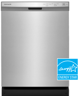
24" Built-In Tall Tub Dishwasher FFCD2418US