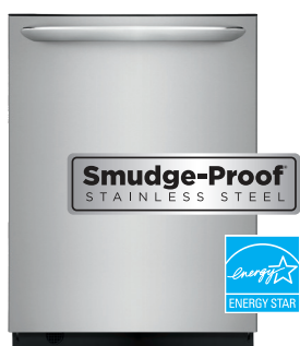
24" Dishwasher FGID2468UF/GDPH4515AF