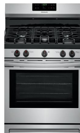
30" Gas Self-Cleaning Freestanding Range FFGF3054TS