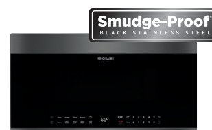
1.9 Cu. Ft Over-The-Range Microwave FGBM19WNVD