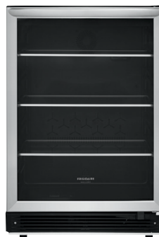
5.3 Cu. Ft. Built-In Beverage Center FGBC5334VS