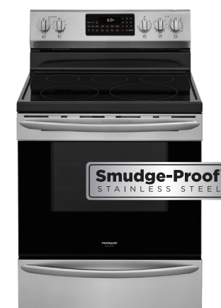
30" Electric Freestanding Range with Air Fry GCRE3060AF