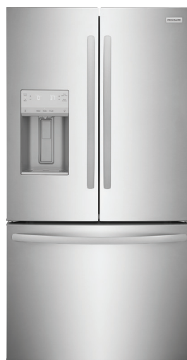
22.6 Cu. Ft Counter-Depth Refrigerator FRFC2323AS