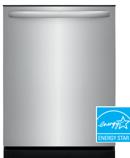
24" Dishwasher FFID2426TS