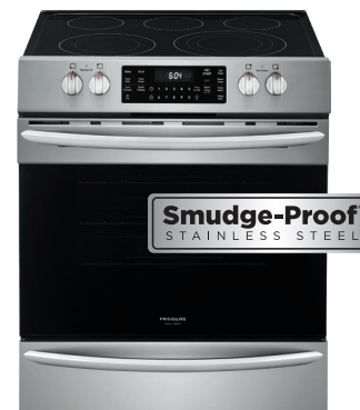
30" Electric Self-Cleaning Freestanding Range featuring Air Fry FGEH3047VF