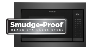
2.2 Cu. Ft Built-In Microwave with Trim Kit