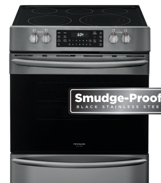
30" Electric Self-Cleaning Freestanding Range featuring Air Fry FGEH3047VD