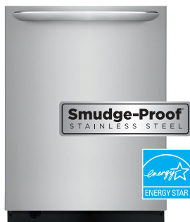
24" Built-In Dishwasher FGID2476SF