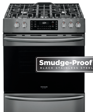
30" Gas Self-Cleaning Freestanding Range featuring Air Fry FGGH3047VD