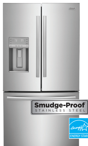
22.6 Cu. Ft. Counter-Depth French Door Refrigerator GRFC2353AF