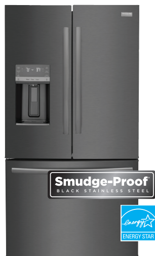
22.6 Cu. Ft Counter-Depth French Door Refrigerator GRFC2353AD