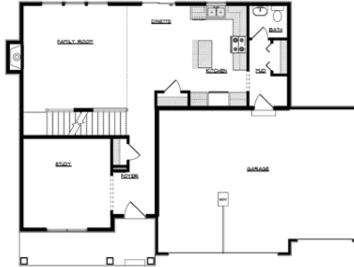
main floor plan